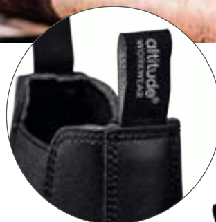
EASY PULL-ON WEBBED LOOP