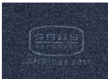
SABS WATERMARK ON THE REVERSE SIDE OF THE FABRIC