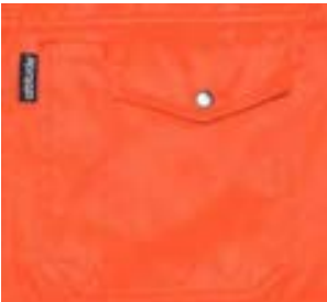
PRESS STUD POCKET CLOSURE & PEN POCKET ON ORANGE & YELLOW JACKETS