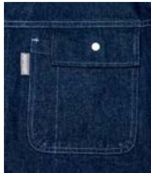
PRESS STUD POCKET CLOSURE, PEN POCKET & CONTRAST STITCHING