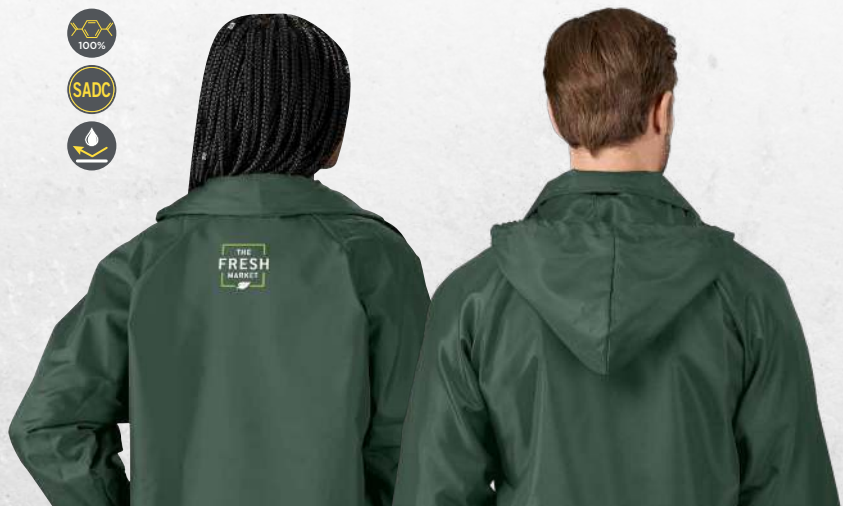
CONCEALED HOOD ON UNISEX & KIDS JACKETS