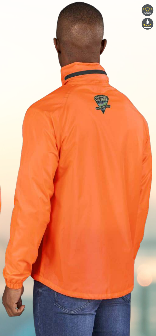
CONCEALED HOOD WITH ZIP CLOSURE