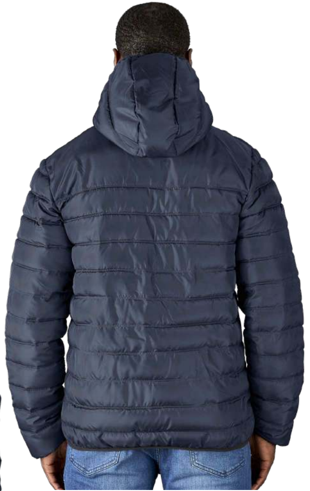
ELE-7306 & ELE-7307 ARE AVAILABLE IN THE 2 COLOURS SHOWN ON THIS SPREAD