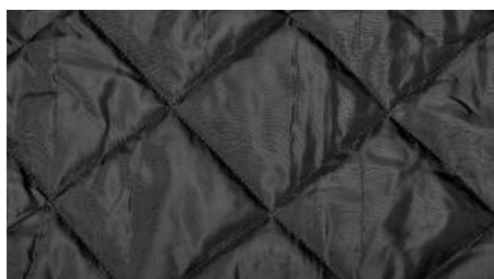
QUILTED TAFETTA LINING