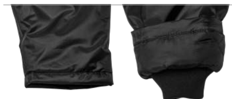
OPEN END SLEEVE