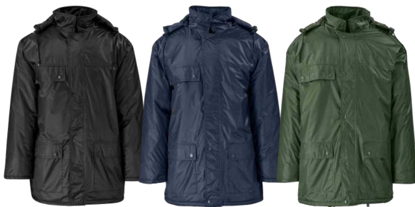
KNITTED INNER SLEEVE CUFF