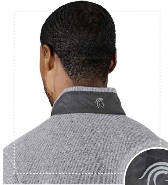
REFLECTIVE BLACK KNIGHT LOGO ON BACK OF COLLAR