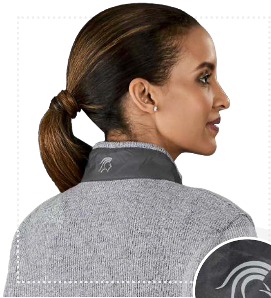
REFLECTIVE BLACK KNIGHT LOGO ON BACK OF COLLAR