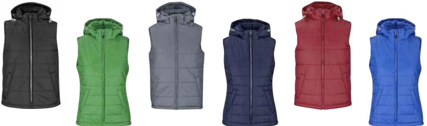
SLAZ-7608 & SLAZ-7609 ARE AVAILABLE IN THE 6 COLOURS SHOWN ON THIS SPREAD